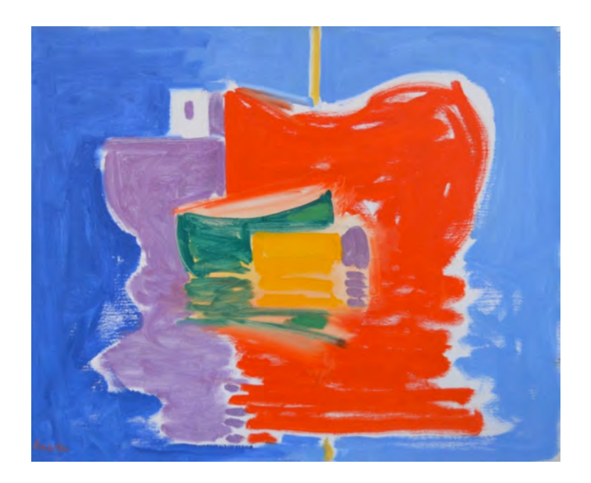
Fig 4. Paul Resika, Chromatic Vessels , 2000. Oil on canvas. 20 x 24 inches.

JF: Ah yes, color is one of your primary languages as well.