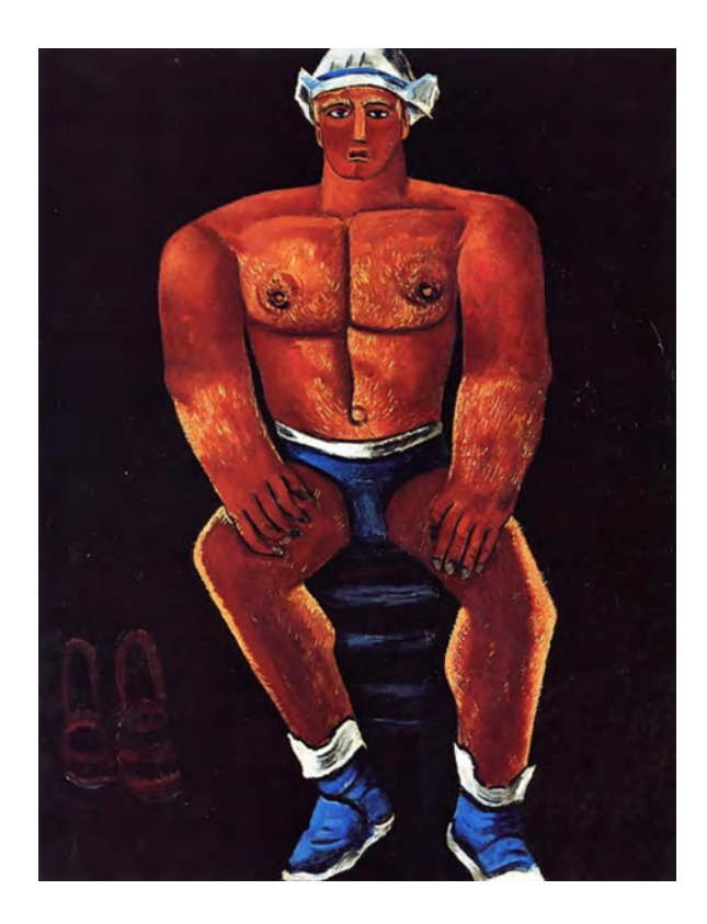
Fig. 9. Marsden Hartley, Flaming American ( Swim Champ ). 1939–1940. Oil on canvas. 40 3/8 x 30 ¾ inches. Baltimore Museum of Art.

exhibited Flaming American (Swim Champ) at Hudson D. Walker Gallery [in New York] the next year, I associated it and another painting with wall panels created for gyms.<sup>5</sup>