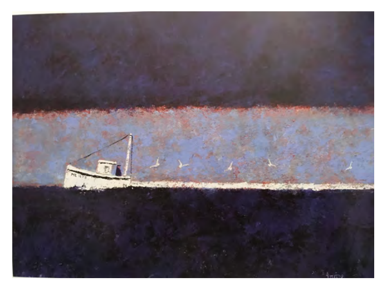
Fig 1. William Irvine, Heading Out , 2012. Oil on board. 26 x 36 inches. Collection Pat and Carol Jackson.

WI: I made a deliberate decision in building the studio to have more wall space. I put in some skylights, but I don't really need the view. By the time I come into the studio, I am all fired up and know what I am going to paint. I come in with a cup of tea and hours later it is cold, as I have forgotten to drink it. I get to look at Tinker Island from my house all the time. And the distinctive Maine clouds stay in my brain. At this point, I don't need to be painting from observation.