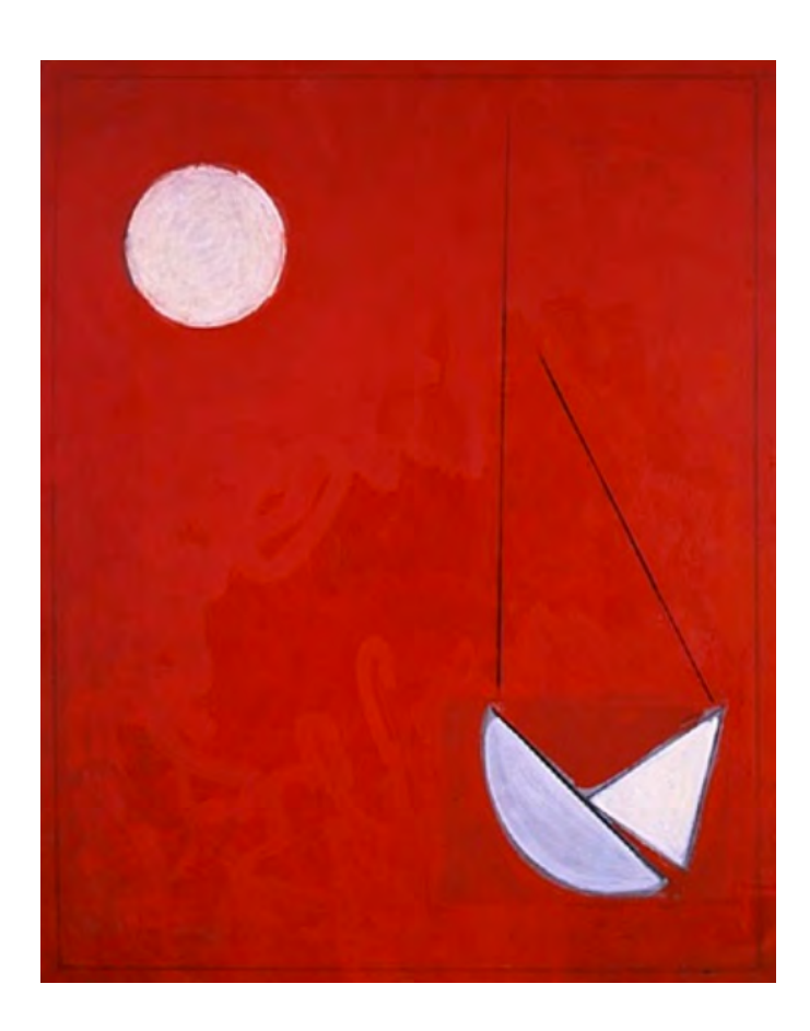
Fig 5. Paul Resika, Moon and Boat (Pendulum), 2003–2007. Oil on canvas. 81 x 65 inches.

a Provincetown I did not know. He responded it was a Provincetown I would or could never know. It was a fiction: fictive music."<sup>2</sup>