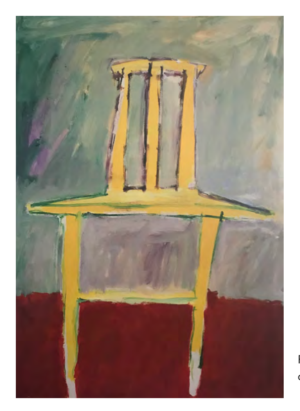
Fig 8. Harold Garde, Yellow Chair , 1983. Acrylic on canvas. 56 x 40 inches.

HG: I didn't mean to render the chairs. I wanted the form. The other two legs were not integral to the image. It is not that I forgot them. I just did not need them.