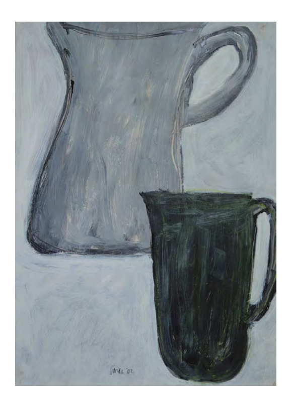
Fig 7. Harold Garde, Two Pitchers , 2002. Acrylic on paper, 30 x 22 inches.

viewer. My challenge is to make the elements work. I do not want it to be or look preconceived.