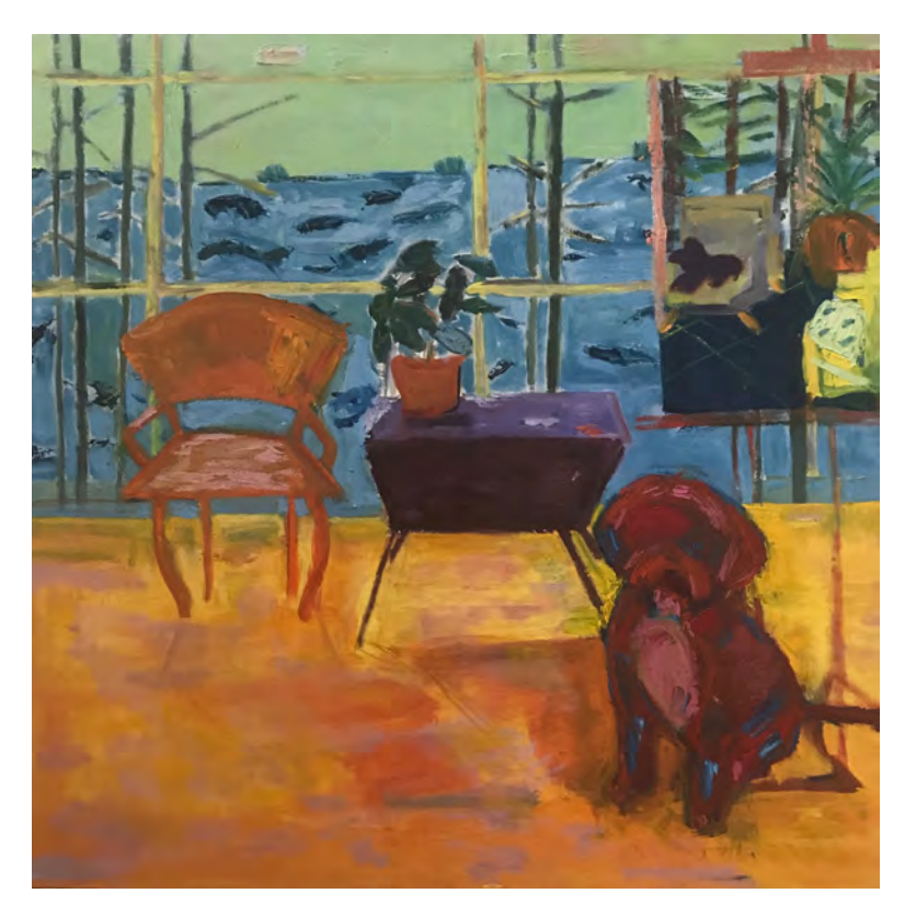
Fig 18. Jill Finsen, Yellow Chair, 2018. Oil on canvas, 36 x 36 inches.