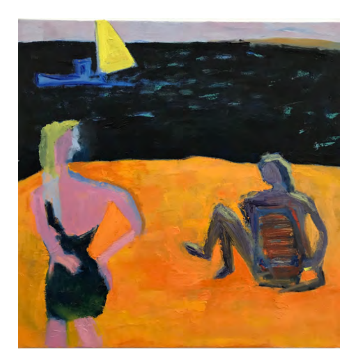
Fig 23. Jill Finsen, Yellow Sail, 2018. Oil on canvas, 20 x 20 inches.