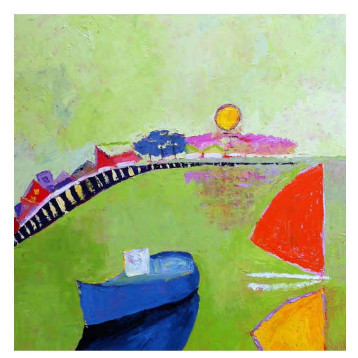
Fig 21. Jill Finsen, Rimmed Sun, 2013. Oil on linen, 30 x 30 inches.