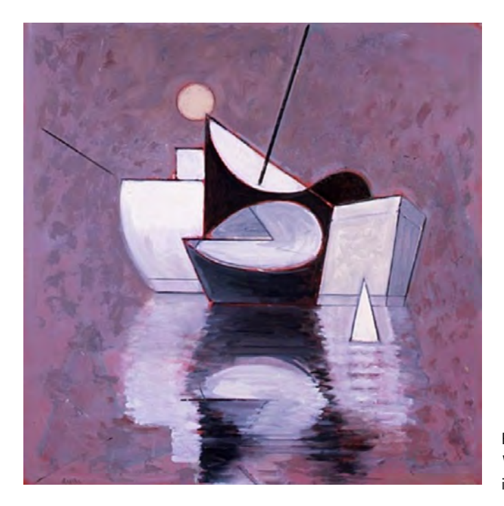
Fig 6. Paul Resika, Black and White Vessels , 2008, Oil on canvas. 76 x 76 inches.

In a series of paintings of boats dating from the late 1990s Resika at last broke away almost completely from the naturalistic imagery. Boat and building-like forms morph into hot and radiantly colored geometric shapes, including rectangles, triangles, squares, and circles, which are flushed against a background field of monochromatic color. David Carbone interprets the vessels as symbolic of "soul boats," and the dashingly painted background quivers and glows with an almost corporeal presence. <sup>3</sup>