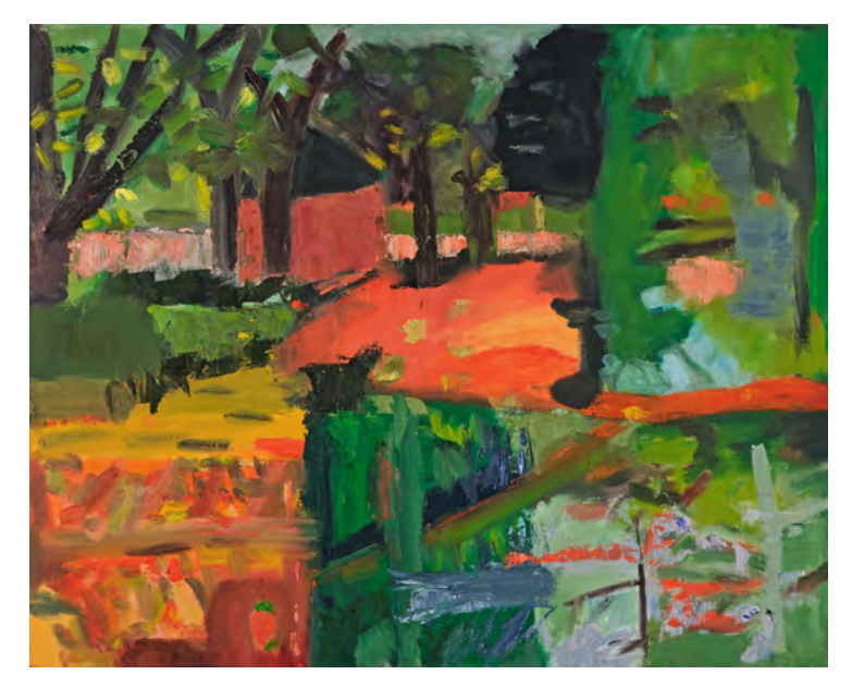
Fig 20. Jill Finsen, Locale One , 2015. Oil on canvas, 24 x 30 inches.