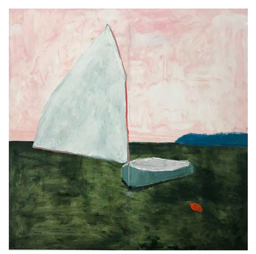
Fig 19. Jill Finsen, White Sail , 2018. Oil on canvas, 36 x 36 inches.