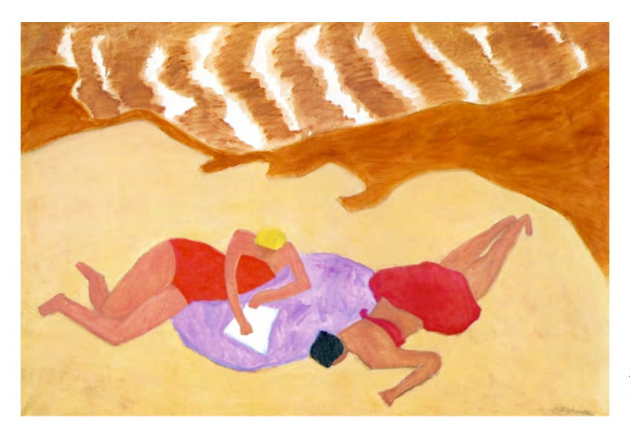
Fig 12. Milton Avery, Bathers by the Sea, 1960. Oil in canvas, 50 x 72 inches. Private Collection.