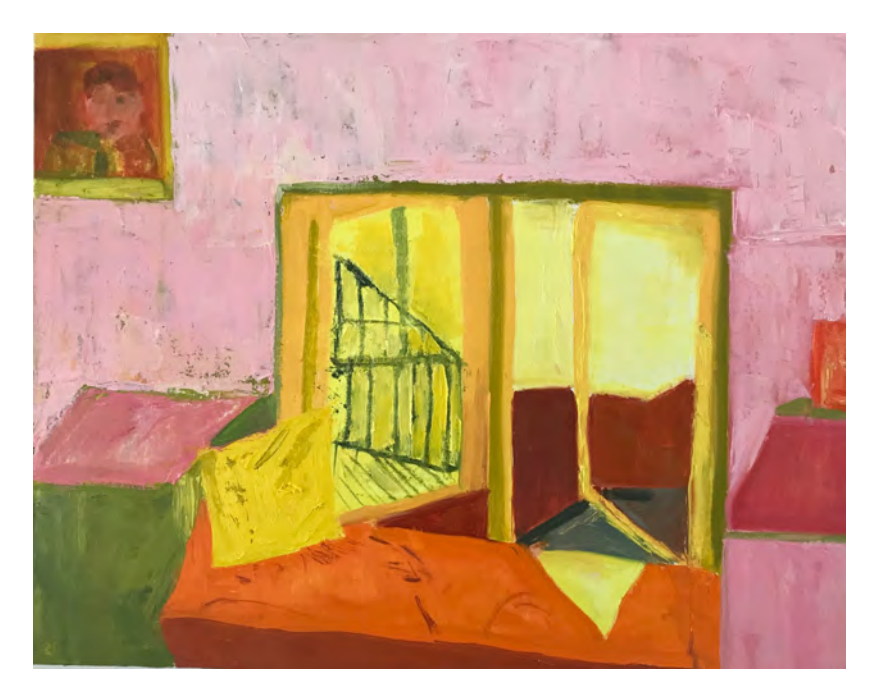
Fig 17. Jill Finsen, Studio View 16 , 2018. Oil on canvas, 22 x 28 inches.